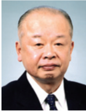
Governor Shosaku Yasui