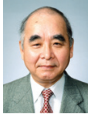
Deputy Governor Katsuhiko Yokota