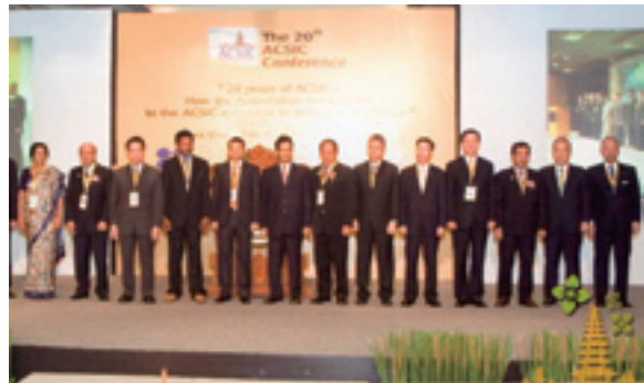
The 20th ACSIC Conference (Indonesia)

The Asian Credit Supplementation Institution Confederation (ACSIC) comprises 16 institutions, including the Korea Credit Guarantee Fund (KODIT), Credit Guarantee Corporation Malaysia Berhad (CGCMB) and the Small Business Credit Guarantee Corporation (SBCG) of Thailand. As an ACSIC member, JASME takes part in the annual conference and promotes the ties with overseas government agencies and financial institutions.