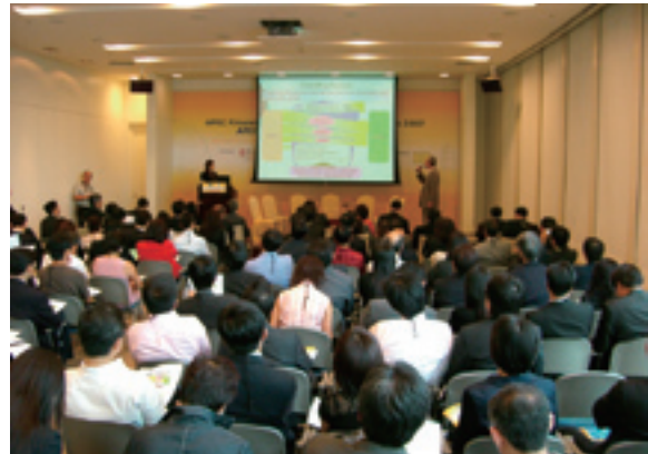
The 4th APEC MOU Annual Meeting (Hong Kong)

Note: Memorandum of Understanding on Cooperation Among APEC (Asia-Pacific Economic Cooperation) Financial Institutions Dealing with SMEs.