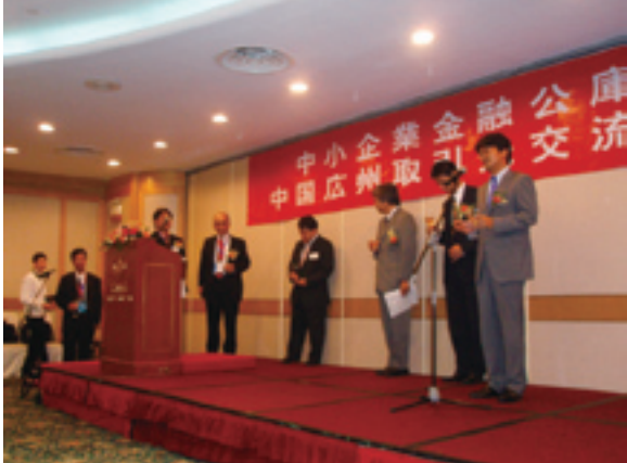
Business Network Meeting for client companies in Guangzhou, China

In addition to the provision of advice on various management matters, JASME, in fiscal 2007, launched support for interchanges among locally operating client companies. Business network meetings were held in Shanghai and two other locations, attracting a total of 269 participants from 160 companies.